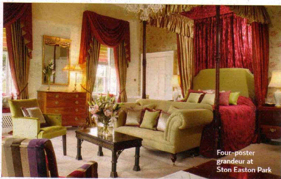
Four-poster grandeur at Ston Easton Park