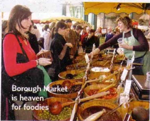
Borough Market is heaven for foodies

Visiting the capital? Head for the revitalised district of Southwark, which is not only home to the super-sexy offices of Marie Claire but also boasts the smart and contemporary Bermondsey Square Hotel (doubles from £109, bermondseysquarehotel.co.uk ). A few paces away you'll find Zandra Rhodes' Fashion and Textile Museum ( ftmlondon.org ), and farther on there are the gourmet delights of Borough Market (Thursday-Saturday) and the attractions of Tate Modern. For lots of insider tips visit notfortourists.com .